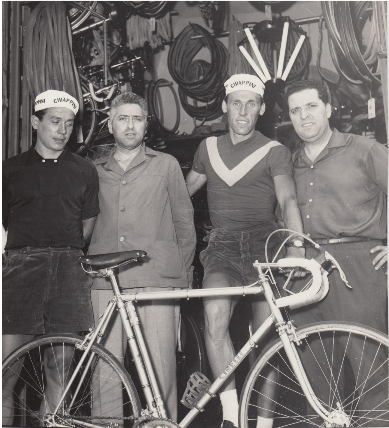
IL RUSSO KAPITANOFF, MEDAGLIA D'ORO ALLE OLIMPIADI DI ROMA DEL 1960, CON BICICLETTA CINELLI E POMPA SILCA IMPERO. = =