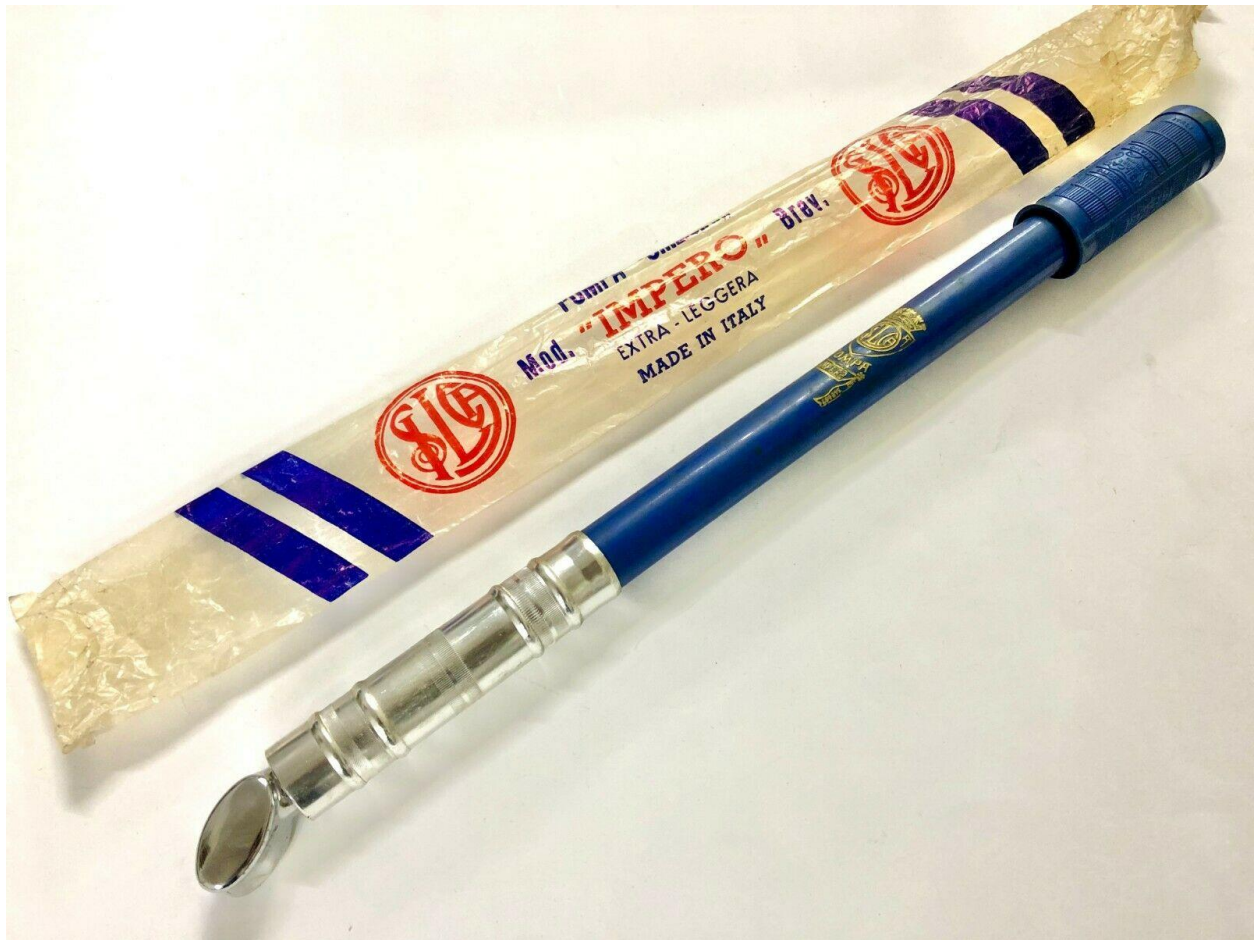
"1972 SILCA Impero Frame Pump"