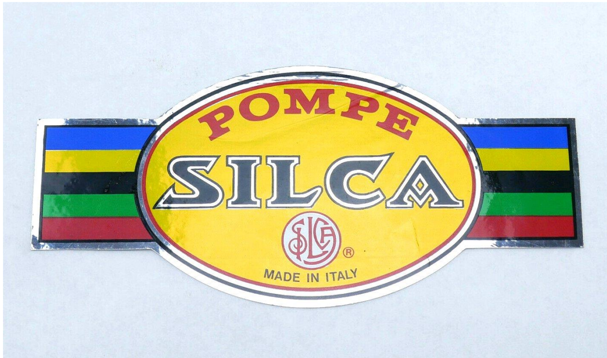
Photo Credit: "1978 SILCA Bicycle Shop Decal" SILCA Heritage archives